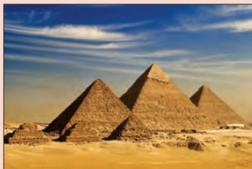
Pyramids of Giza , the oldest of the Seven Wonders of the Ancient World.