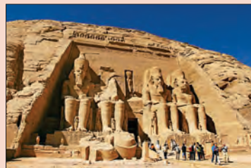
Abu Simbel . Massive rock temples in South Egypt.