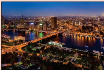
Cairo (capital). Population: 23 million.