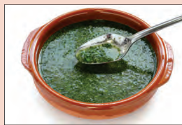
Mulukhiyah . Famous Egyptian soup.