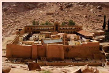
Saint Catherine's Monastery . One of the world's oldest working Christian monasteries.