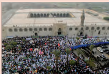
Mosque of Amr Ibn Elaas . First mosque in Egypt and Africa.