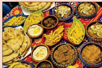
Fowl & Falafel - traditional breakfast.