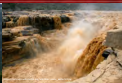
Yellow River, 3,395 miles long