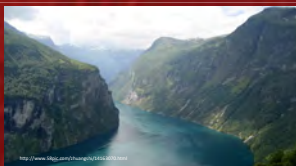
Yangtze River, 3,964 miles long

China belongs to the continent of Asia. It has many different landscapes, including mountains, high plateaus, rolling plains, terraced hills, deserts, and forests.