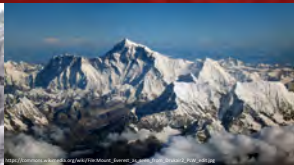
Mount Everest, 29,029 feet