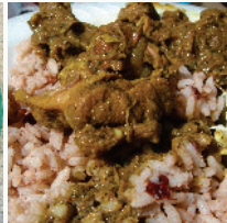
Curried Goat and Rice & Peas