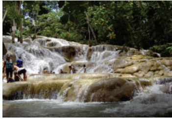
Dunn's River Falls - Ocho Rios