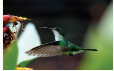
The "Doctor Bird:" only in Jamaica