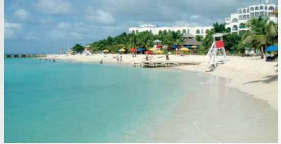
One of the most popular tourist destinations in the Caribbean