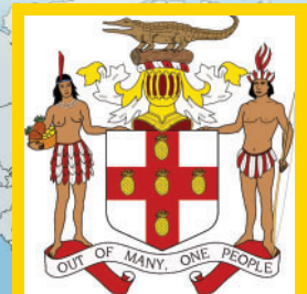
Coat of Arms; featuring Arawak Indians

Tifton, GA to Kingston, Jamaica 1,020 miles