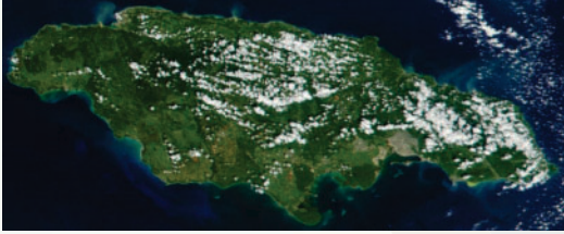
Jamaica is an island, surrounded by the Caribbean Sea